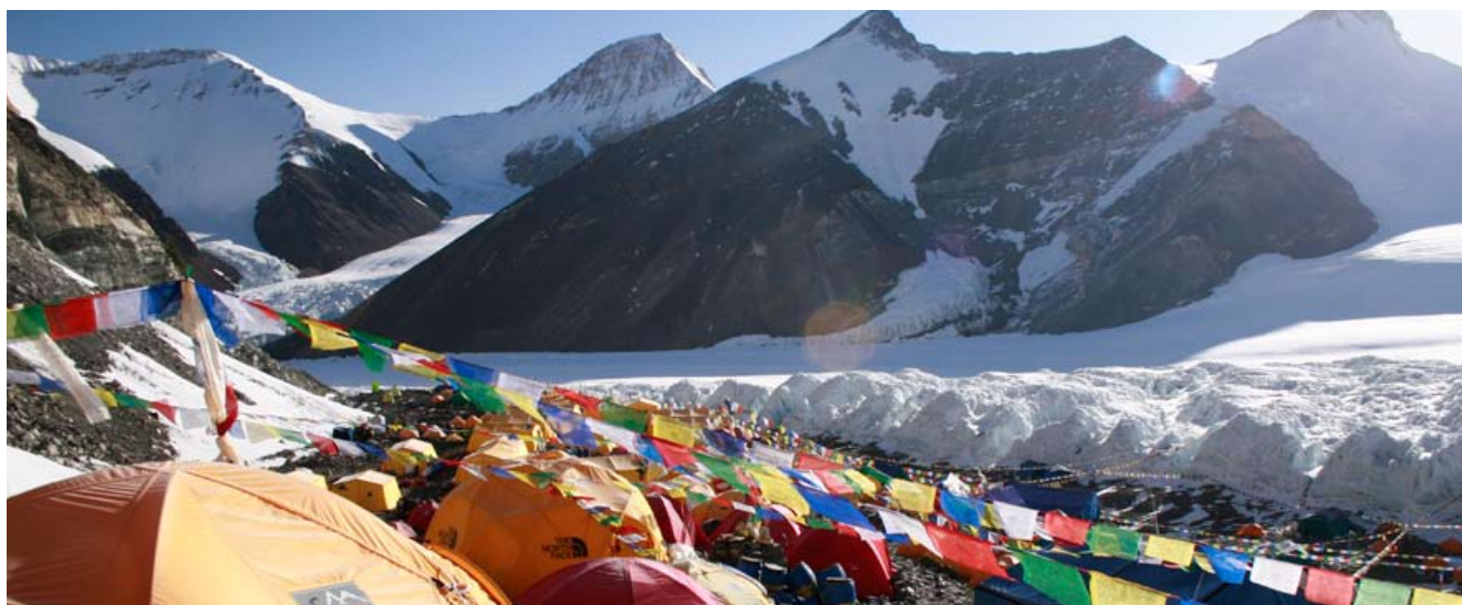
Advance Base Camp, 6,400m