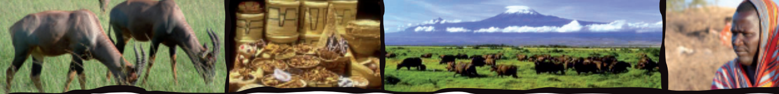
Table 1. Major Travel Health Issues & Considerations for Kenya